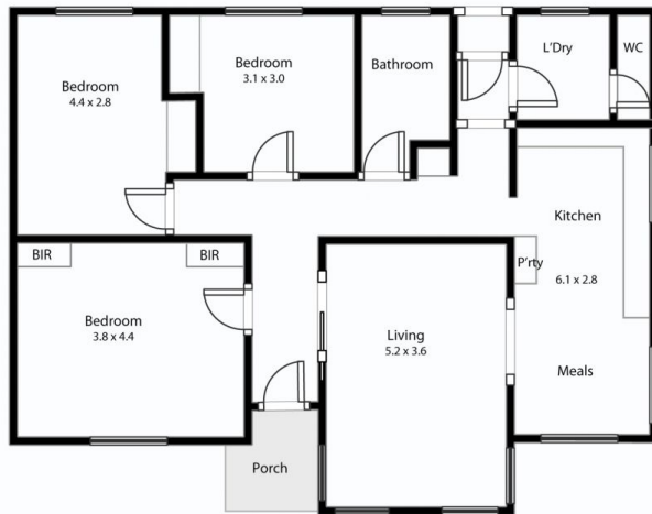
Carport/Garage Not in Position