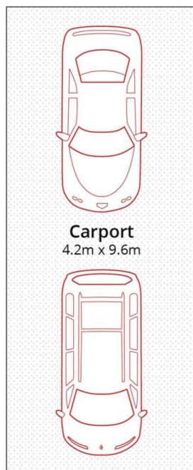
Carport 4.2m x 9.6m